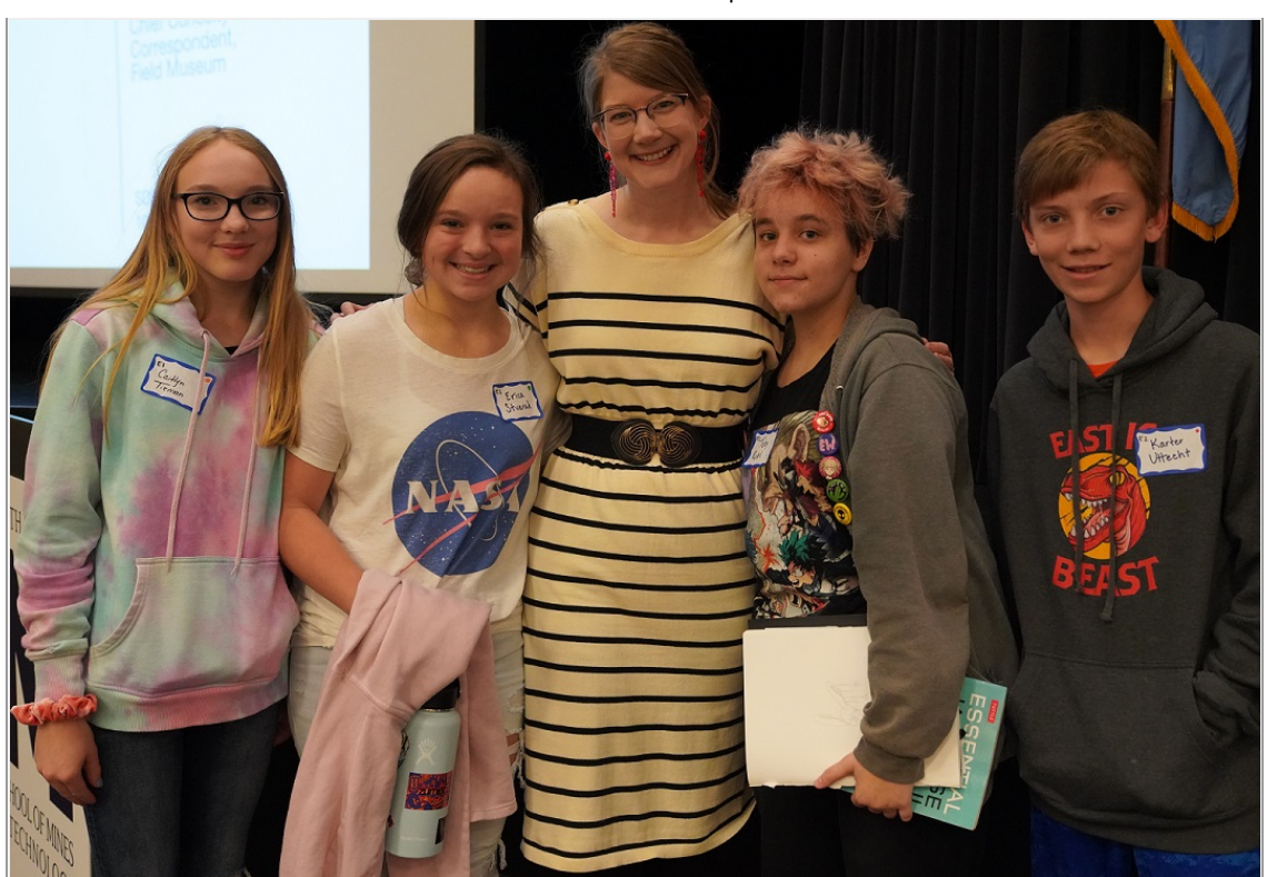
RCAS 8<sup>th</sup> Grade Students with featured speaker, Emily Graslie. Emily is a Rapid City Native, host of the popular YouTube channel "The Brain Scoop", and Chief Curiosity Correspondent for the Field Museum in Chicago.