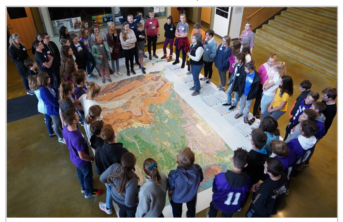
RCAS 8<sup>th</sup> Grade Students touring the Paleontology Research Laboratory at the South Dakota School of Mines and Technology.