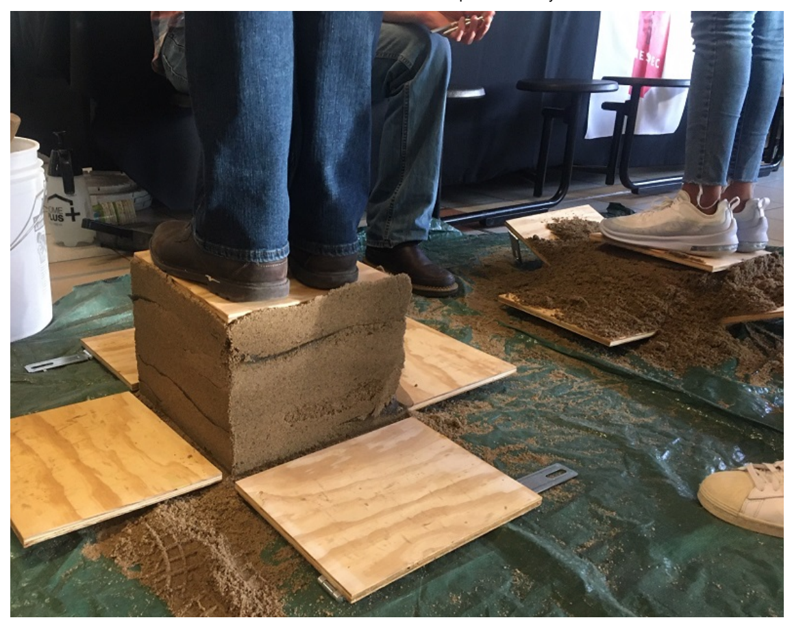
Central HS students test reinforced vs unreinforced soil. SDES and RESPEC hosted a joint booth at the high school STEM career fair.